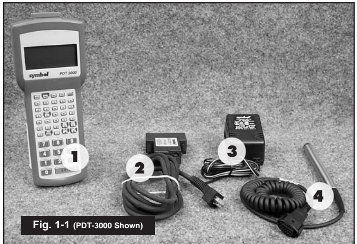
Connecting the AC Adapter to the Charging Cable